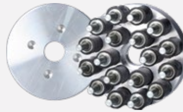
DESLAGGING BRUSH DT 115X2

The strength of the HERO R2 deburring disc becomes especially apparent with thick metal sheets. The high abrasive density combined with flexible lamellae enables intensive and even edge rounding, even with complex geometries. "The grinding pattern is outstanding, the edge rounding is excellent. A real added value for our customers", confirms Kuno Fokken.