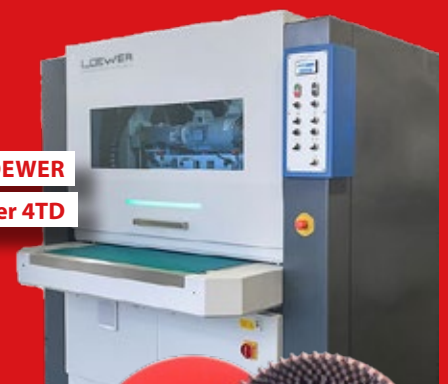
LOEWER DiscMaster 4TD

The grinding pattern is outstanding, the edge rounding is excellent. A real added value for our customers.